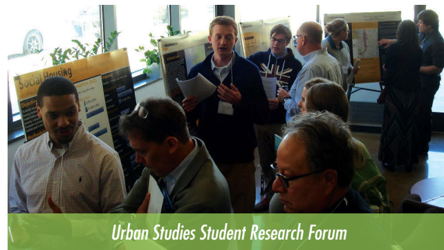
Urban Studies Student Research Forum