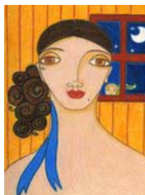
Cover art by Edna Collazo.

The Department of Spanish and Portuguese is happy to report that the first number of Luna Creciente is out and available for viewing online via the Department's website.