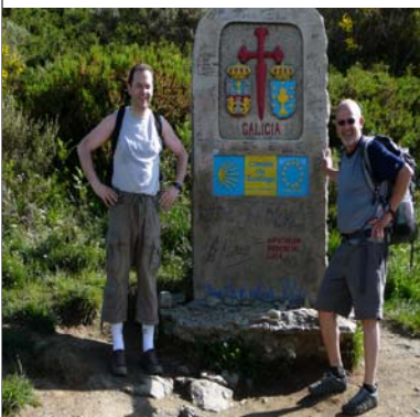
Camino de Santiago: