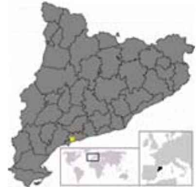
Map of Tarragona, Spain.