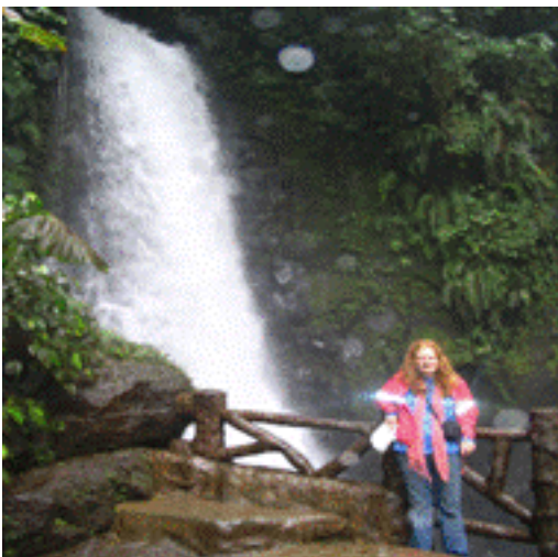
Waterfall in La Paz, Bolivia.

The Department of Spanish and Portuguese at the University of Wisconsin-Milwaukee is committed to providing the best instruction in the areas of language, linguistics, translation, literature and civilization. A primary goal is to foster interest in the knowledge of Hispanic and Luso-Brazilian cultures.