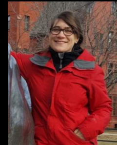
Waste & Recycling Specialist