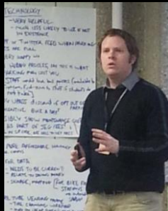
Policy & Planning Analyst