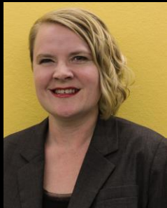
Chief Sustainability Officer