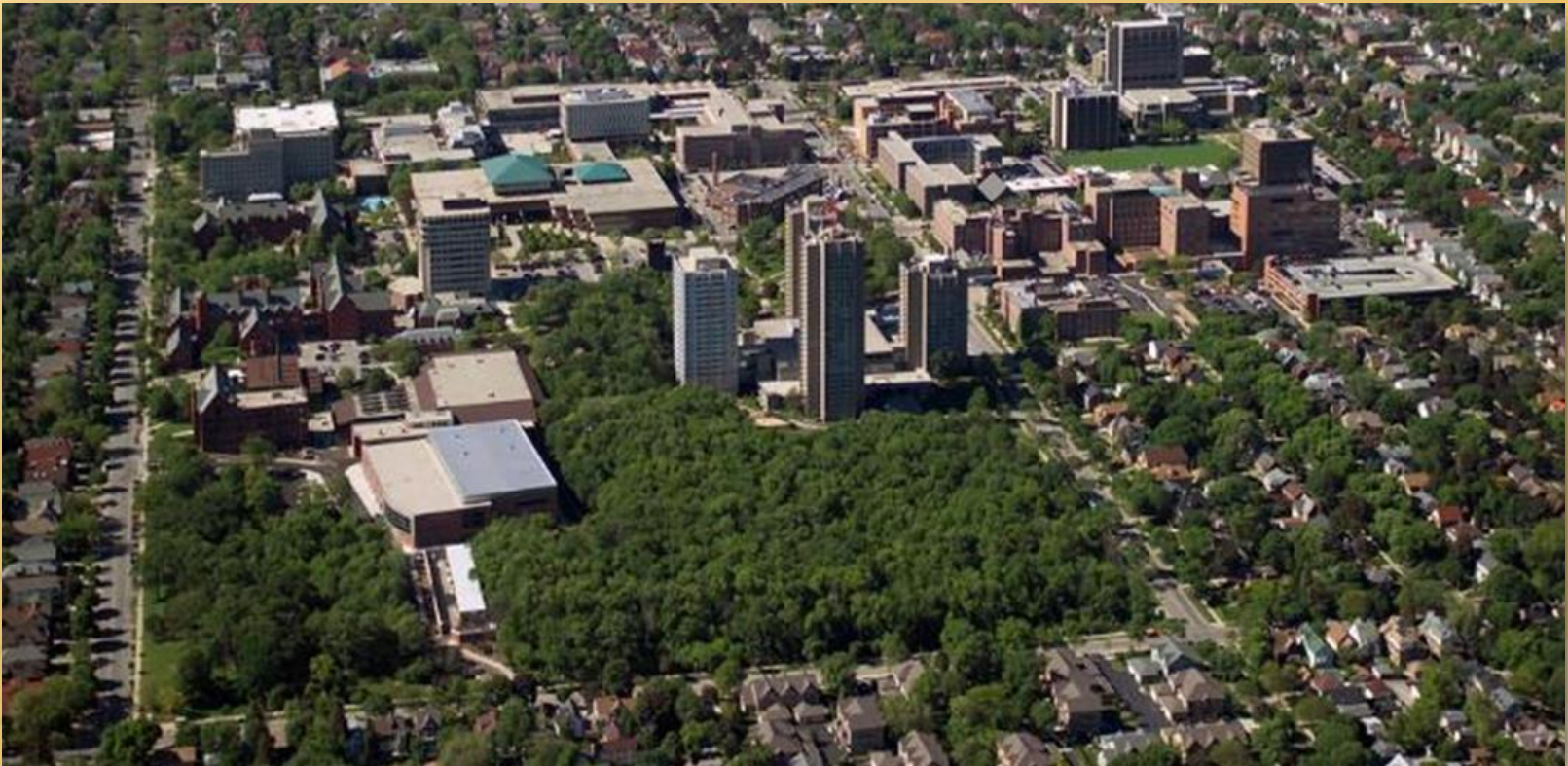
Kenwood Campus Looking South