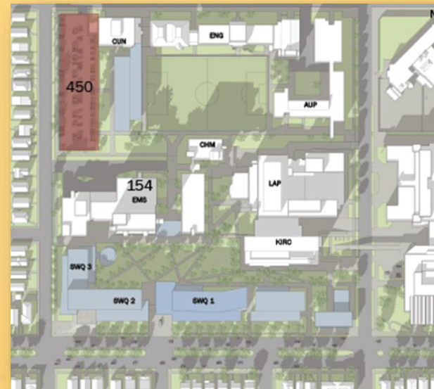
SWQ Parking Structure