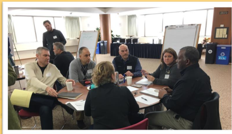
Planning Retreat March 2019