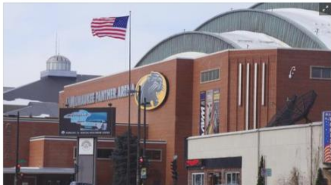
UW-Milwaukee Panther Arena in downtown Milwaukee

Email Share In Share Tweet Save Print Order Reprints