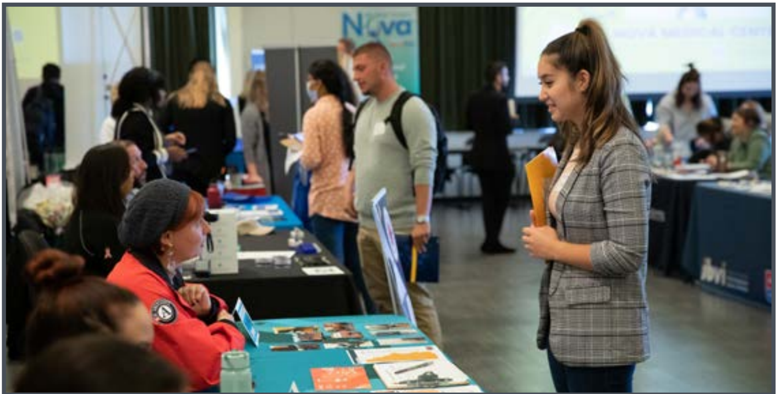
Students speak with employers from around the country at one of SET's Career Fairs.

As alumni, you're able to get involved with a career community and work as a partner to network, connect, and be a resource for students. Become a partner and learn more by emailing SET at careerplan@uwm.edu !