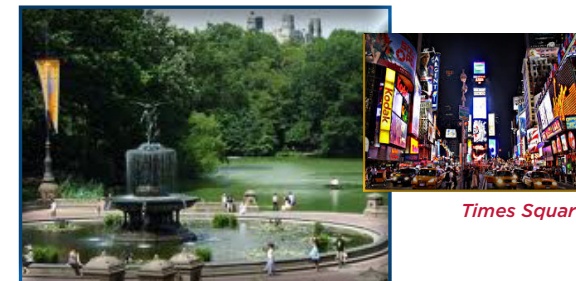
Central Park Fountain

New York is the center for many important businesses—such as mass media, publishing, advertising, fashion, finance, law, and non-profits. Interested students use their time in New York to make connections, find internships, and look for jobs.