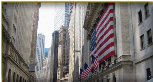
New York Stock Exchange

Country meetings are held with traditional and emerging great powers, states involved in military conflicts, and a broad sample of others drawn from all of the major world regions. UN organization meetings cover major issues such as peacekeeping missions, international terrorism, economic development, and environmental conservation.