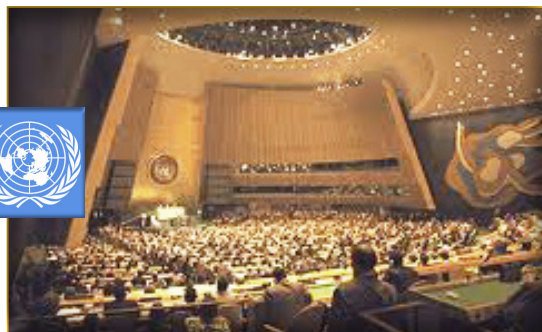
UN in Session

Since 1966, students from all UW System campuses and other universities have participated in this five-week, six-credit program at United Nations Headquarters in breathtaking Manhattan. The four weeks in New York include special access to UN facilities and intensive interaction with over 40 experts representing governments and international organizations.