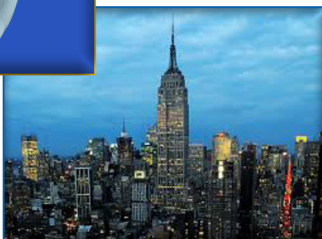
Empire State Building