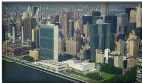
Aerial View of the UN

The program investigates the fundamental issues about international organizations. How do they work? What impacts do they have? How do regimes and governments ruling the member countries use international organizations to pursue their goals?