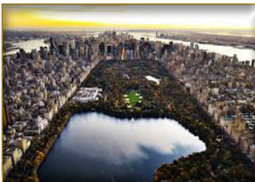
Aerial View of Central Park