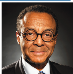
Clarence Page Moderator Pulitzer Prize-winning journalist, Chicago Tribune