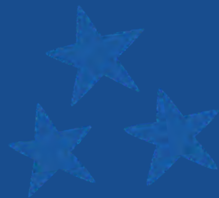
New members at Columbia University in 2017