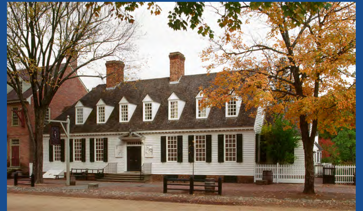
The Raleigh Tavern in Williamsburg, VA