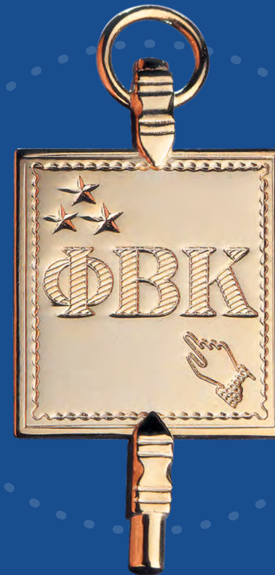
The most recent edition of the \Phi BK key, designed in 1928