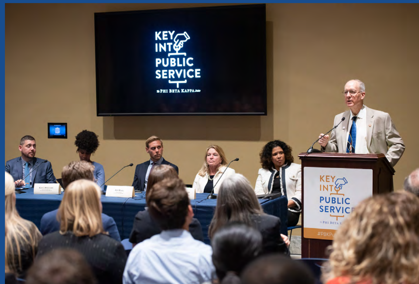
Representative Bill Foster (D-IL) speaks at the National Arts & Sciences Initiative's 2019 Key Into Public Service panel

The Society helped found the National Endowments for the Arts and the Humanities, our signature legislative accomplishment. Today, the National Arts & Sciences Initiative gives members like you tools, data, and resources to advocate for policies that increase access to and strengthen arts and sciences education.