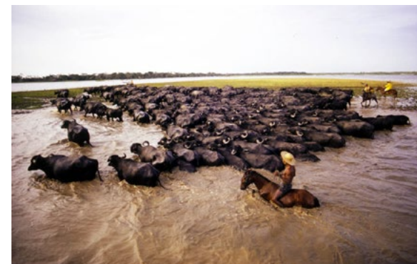
Water buffalo roundup, Marajó Island, Brazil, 1971.