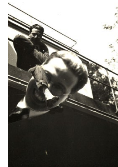
[Self-portrait], László Moholy-Nagy, c. 1925. The Little Review Collection, UWM Archives.