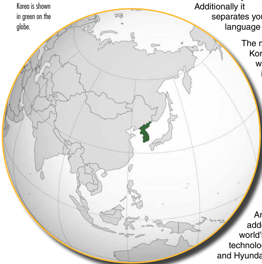
Korea is shown in green on the globe.