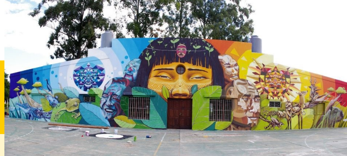
Alapinta mural in San Cosme, Argentina Tour 2012

Another degree option is the Accelerated BA/MA Degree in LACUSL (BA) and Translation (MA) for students with advanced Spanish or French skills. Detailed information can be found on the LACUSL webpage.