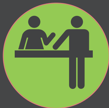
Service & Hospitality