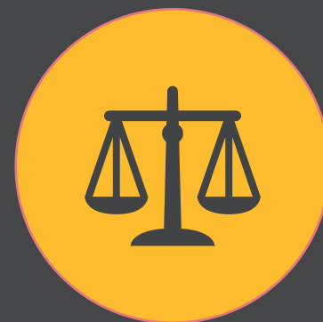
Law & Criminal Justice