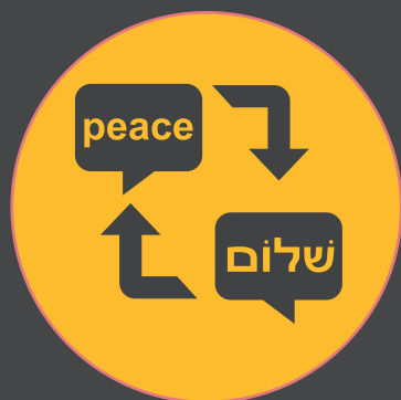
Translating & Interpreting