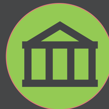
Art and Culture