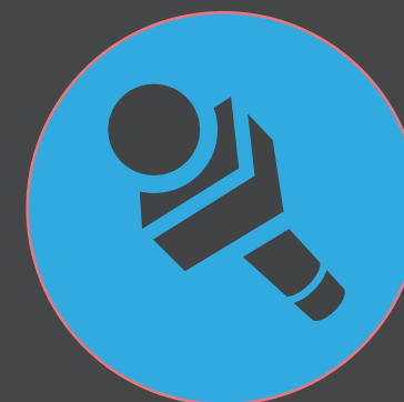
Media and Communications