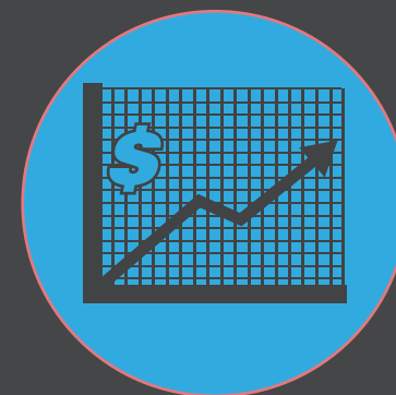
Business & Finance