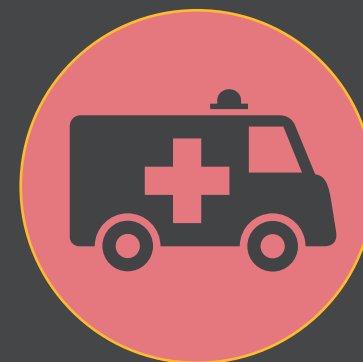
Medicine & Health Sciences