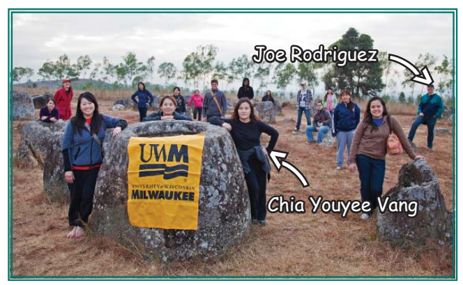
UWM students and faculty visited the Plain of Jars, an archeological site in Xiengkhouang, Laos thought to be an ancient burial ground dating from the Iron Age. (January 2011)