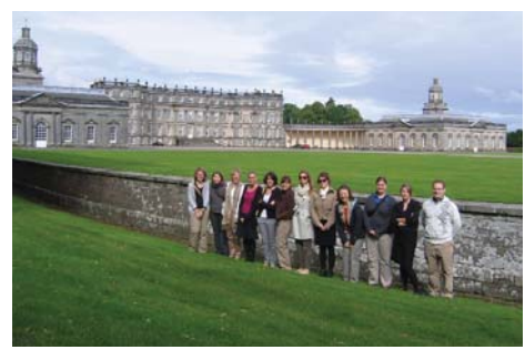
Study abroad group outside of Hopetoun House

Through readings, lectures, behind-the-scenes tours and daily discussions with many hospitable Scottish colleagues, the class gained a comparative understanding of