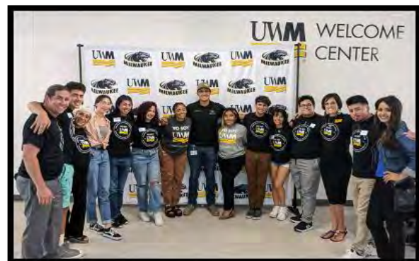
Fall 2022 "Bienvenida" for new Latinx students