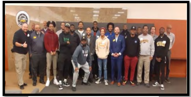
Brother to Brother Support Group