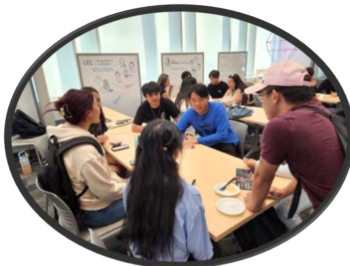
Icebreakers during the SEAASC Kickoff

Staff collaborated with various campus partners to host over 15 programs and events. Some of the programs focused on students’ well-being and social interactions. For example, the center began the spring semester with Bahn Mi & Bowling retention event, which attracted 71 students. SEAASC held its popular series, Mindful Midterms , where students participated in de-stressing activities, such as line dancing, painting, bead-making, and playing board games. The annual SEAASC Kickoff during the fall semester introduced students to our services and staff.