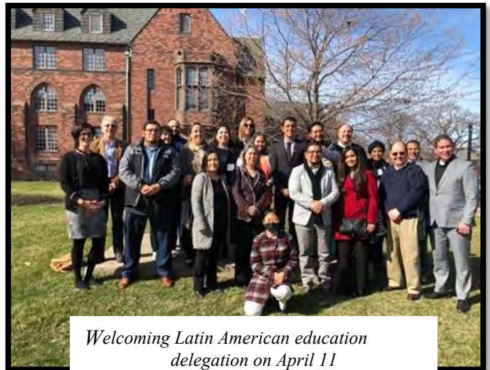
Welcoming Latin American education delegation on April 11