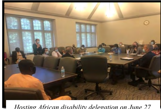
Hosting African disability delegation on June 27.