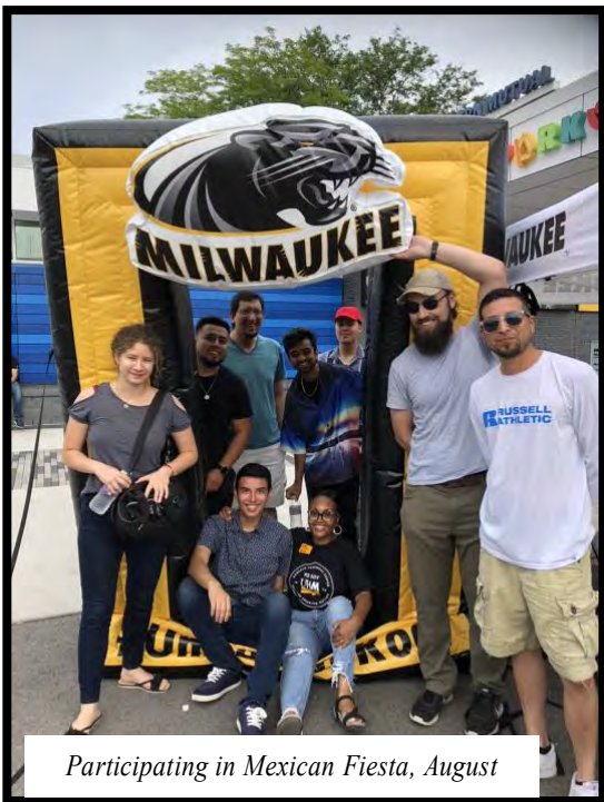
Participating in Mexican Fiesta, August