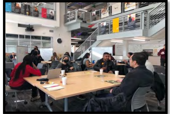
October 20 Mosaic Network Reception

Our Mosaic Network (previously called Faculty of Color Mosaic) had for many years focused on supporting faculty of color with tenure and promotion. In our efforts to be more inclusive, Mosaic Network now welcomes campus members from all employee categories. DEI senior leaders plan and implement a series of events and activities throughout the year that are designed to engage employees who self-identify as Black, Indigenous, Asian and Latinx in discussions about recruitment, retention, promotion and climate issues on campus. Monthly drop-in sessions take place where those at the table set the agenda for discussion. We participated in efforts that other campus units led focusing on mentoring of faculty and staff (e.g., Multicultural Scholars Collaborative, Graduate School, CETL).