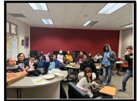
Anime night in the BSCC attracts diverse