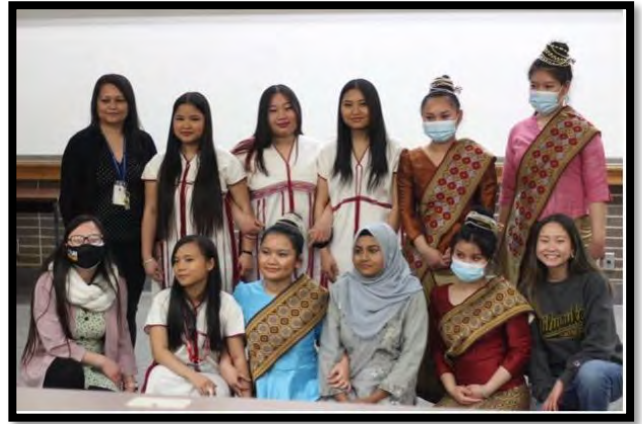
SEAASC staff with South Division staff and students at Asia Universe performance

SEAASC staff also planned culturally relevant programs. In April, we collaborated with the UWM Planetarium, Hmong Diaspora Studies Program at UWM, and South Division High School to put together cultural performances and a planetarium show called Asian Universe . Later that month, we collaborated with the Lubar Entrepreneurship Center and the Institute of World Affairs to bring the co-founders of Tuk Tuk Box for a 3-day programming that focused on AAPI healing and entrepreneurship. The speakers led an AAPI healing circle with UWM students, gave a talk on building a business to UWM students, and made a presentation about entrepreneurship to high school students at Hmong American Peace Academy. During the fall semester, we collaborated with the Women’s Resource Center and the Inclusive Excellence Center to create a series called Feminist Fiber Arts, and the first couple of activities focused on Hmong embroidery (Hmong flower cloth).