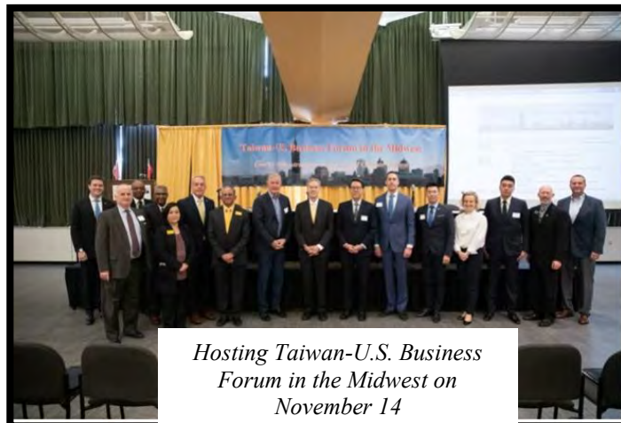
Hosting Taiwan-U.S. Business Forum in the Midwest on November 14