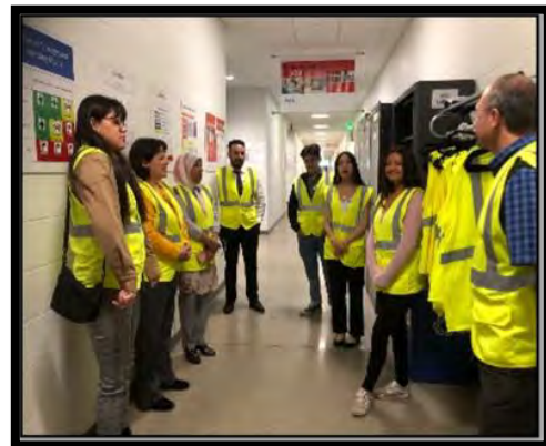
WiscAMP scholars and staff with Eaton engineers on November 11