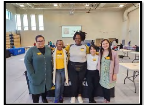
Recruiting at HAPA’s College Fair with Office of Undergraduate Admissions