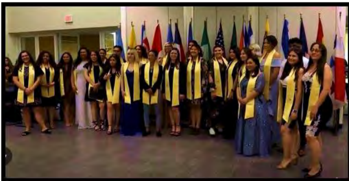
PALM Graduation Gala at UWM Union Ballroom celebrated families and graduates.