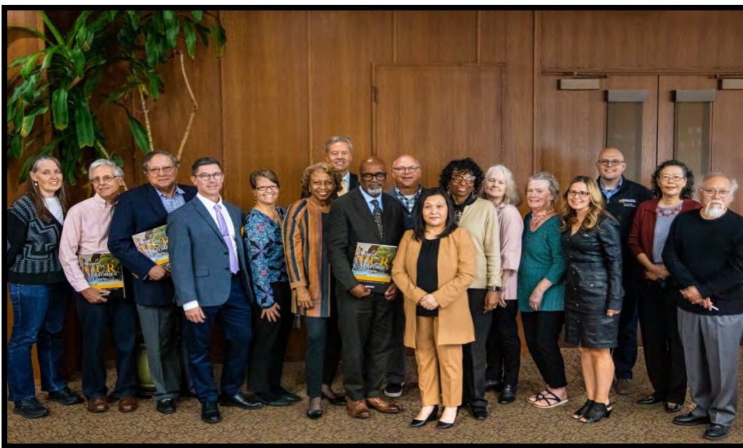
September 27 Celebration of Diversity Book at Golda Meir Library