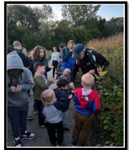
Urban Ecology Center event in October

In September 2022, SPSP moved to be co-located in the Children's Learning Center (CLC). Operating out of the same space provided an opportunity for SPSP and CLC staff to take a 2Gen (whole family) approach to supporting UWM's parenting students and their families. They were able to jointly coordinate equitable access to programming, support, and services necessary for students with children. After the move, SPSP returned to hosting events and programming solely in person for the first time since 2020. Some highlights from the Fall 2022 semester include an evening with the Urban Ecology Center to celebrate the Fall Equinox with UWM families, a Student Parent Welcome as part of Family and Friends Weekend in October, Family Bowling in the UWM Union Rec Center, and in-person parenting workshops. The workshops were held in CLC, with childcare and dinner was provided. To better understand the needs and interests of student parents, SPSP administered a "Student Caregivers in Higher Education" survey. We anticipate that the results will be available in early 2023 and the findings will inform the university's services to our caregiving population on campus.