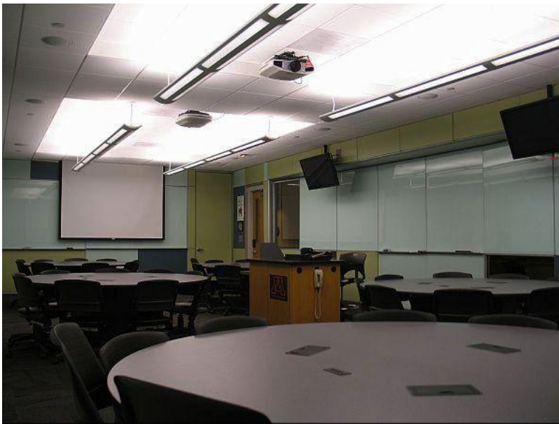
Figure 3. The Active Learning Classroom