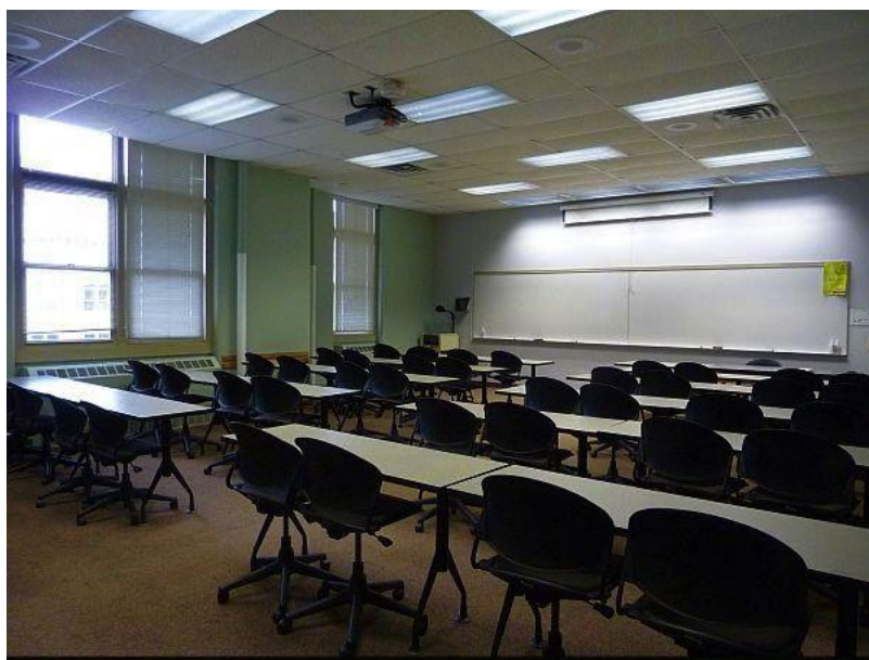
Figure 1. The Traditional Classroom