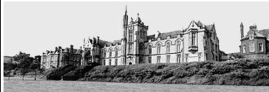
Magee College University of Ulster, Derry

All participants partake in an intensive Irish language course at a premiere language institute in County Donegal. The majority of time is spent studying a range of topics at Magee College in Derry,