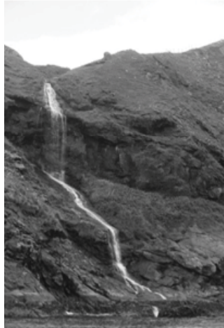
Suabh Leabhe Cliffs

in the pub where you will sing even if you don't sing. It is in the pub where you will dance even if you don't dance. It is in the pub where you will speak Irish even if you don't speak Irish. And it is in the pub where even if you don't drink you are destined to have a great time and talk with people you could never meet at home. The pub is where the culture combines at the end of the day and makes an atmosphere suited for anyone of all ages.