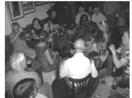
Seisiún at Roarty's Pub

Besides all the good craic the scenery along the coast of The Glen is an eye opening masterpiece that can't be copied onto a picture or postcard even with the most advanced camera available today. The cliffs and landscape are simply something to experience and see for yourself. Farmers settled in Glenn between 4,000 and 3,000 BC.. What is left behind of the early settlers are ancient tombs. Glenn holds 9 portal tombs across its land, the largest group of portal tombs in Ireland. There are also 15 archaeological stations to visit that combine to make a pilgrimage route. This Turas is performed barefoot on June 9th (St. Coulmcille's feast day) every year. Each station has special prayers and rituals that are still performed and are believed to be pre-Christian practices.