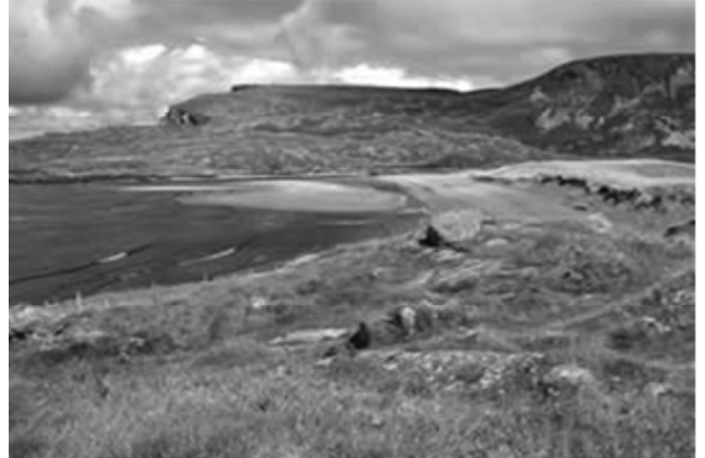
Glencolmcille, County Donegal

From medieval times to the present, Ireland has inspired writers, fascinated visitors, and beguiled the uninitiated with its captivating countryside; its wealth of music, art, and architecture; its lifestyle and history—an ideal destination for an in-depth cultural experience! As a participant on the Colmcille Semester, you will experience the life and culture of two very different places on the Irish landscape. Course-work emphasizes Irish language and culture and Peace and Conflict Studies with additional modules in Poetry, folklore, archeology, and popular culture. This English-speaking, semester-long study abroad program is divided into modules of varying duration between Glencolmcille - a small coastal valley community in the Donegal Highlands in the Northwest corner of the Republic of Ireland, and at the University of Ulster, Magee College, Derry – the second largest city of Northern Ireland, United Kingdom. These program sites are selected to allow for an exceptional range of study options which include opportunities for internship, fieldwork, applied history workshops and independent research. The program also includes field trips to Dublin, Sligo, and Gewwdore.