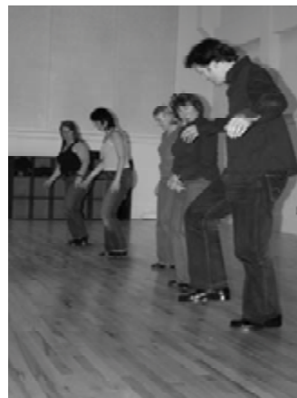
Sean Nös Dance Clan

Tráthnóna Dé Domhnaigh sular scaip an slua meabhradh dóibh gur thug Douglás de hÍde cuairt ar Mhilwaukee os cionn céad bliain ó shin. B'é 'Mala Néifin' an t-amhrán a chan muintir shean-nós Milwaukee 2008 sular tugadh aghaidh ar an mbaile.