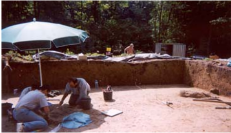
Digging up the Celtic past in southern Germany