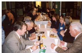
Conference participants enjoy lunch at the ICHC