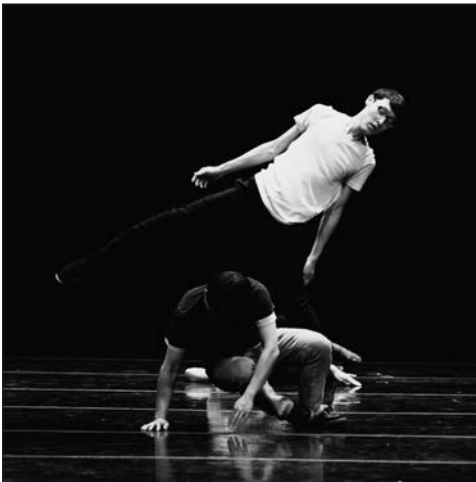
Rainer: Trio A in Ten Easy Lessons. 2009.

their own swooping or jerking or hand-splaying motions.