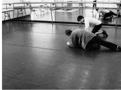
Rainer teaching Trio A. 2008.

What, for Rainer, is the medium of the body about? She has many metaphors for the dance, most of them mechanical: an airplane coming in to land, a motorized machine for flapping the ears. When teaching, Rainer said that one of the things that makes it so very hard to learn is that “there is more energy where you wouldn’t expect it and less energy where you would expect it.” But it is a faulty machine, she admits, unruly and bizarre, with potential for failure and humiliation and foolishness and fragility and vulnerability. Thus at one point she instructs that you “scramble up however you can.” Body parts scatter and disperse: they become unfamiliar and disembodied, as if they had minds of their own. You “unspool your arm from your body,” or your foot “skitters along like a mechanized bug,” or you lean back as if your leg had suddenly become leaden and were too heavy to lift.