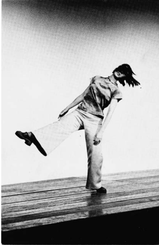
Yvonne Rainer. The Mind Is a Muscle, Part I (Trio A). 1973.