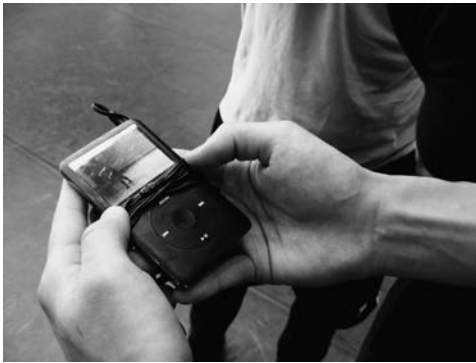
Student learning Trio A. 2008.