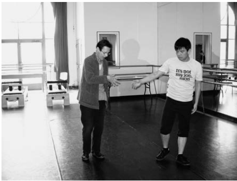
Yvonne Rainer teaching Trio A. 2008.

head to the left, and bend your knees. It took me an embarrassingly long time to do that right. I could not always reconcile what I knew to be the required gesture (such as a modified version of an arabesque that the trained dancers could leap into with little prompting) with the limitations of my body as I wobbled, tripped, and fell. My knees didn't bend the way they were supposed to; my sense of my center of gravity and balance was totally off; and as Rainer once said to me, her brow furrowed with concern, "Do you even know how to run?" For it turns out that most of our received ideas about this dance are slightly misleading; it is not full of "everyday" actions (for instance, it includes a free handstand in the middle of the room, and balance en demi pointe while wearing tennis shoes). Rather, it is exhausting, it is strenuous, it is very physically challenging, and Rainer has incredibly precise ideas about the ways the body needs to configure itself, where exactly the gaze should land, how even the fingers should be positioned. One does not sloppily move through a series of somewhat improvised or random motions; every tiny movement is prefigured, and it takes a great deal of concentration and work. Far from a free-form, unstructured terrain of unconstrained movement, Rainer's instructions were a reminder that dance, though it can be deeply pleasurable, is equally a discipline, concerned with techniques of training and regimes to shape the body.