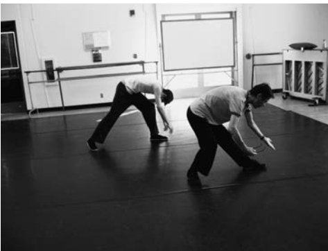
Rainer teaching Trio A. 2008.

described in the same language as other Judson Church pieces, such as Rainer's work We Shall Run from 1965, in which its participants jog for seven minutes onstage wearing regular street clothes. 15 Such task-based movement sought to counteract the prevailing conventions of dramatic modernist dance by aligning itself with "found" motions, rather than refined, spectacular phrases that only a talented professional could possibly execute. A "found" or task-based motion means to visually index the exact amount of energy it takes to execute it, rather than partake of the myth of effortlessness. In Trio A , the body is further made intentionally awkward: the head is thrown back; shoulders hunch and the mouth gapes; arms are inelegantly arrayed; the body jerks and hops and rolls and heaves through a series of actions that are strenuous but do not require specialized balletic training.