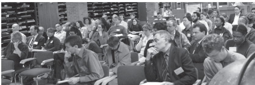
audience at Routing Diasporas conference, American Geographical Society Library, April 8, 2005