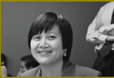
Top to bottom: Nam June Paik, Gayatri Spivak, Ihab Hassan, Jean François Lyotard, Rey Chow