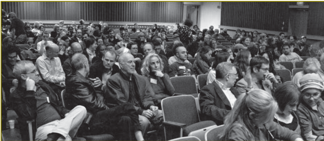
Audience at Carolee Schneemann's keynote presentation for SINCE 1968, the Center's 40th anniversary conference (UWM Union Theatre, Fall 2008)

The Center is located on the top floor of Curtin Hall, a nine-story building that houses most of the humanities departments at UWM and overlooks