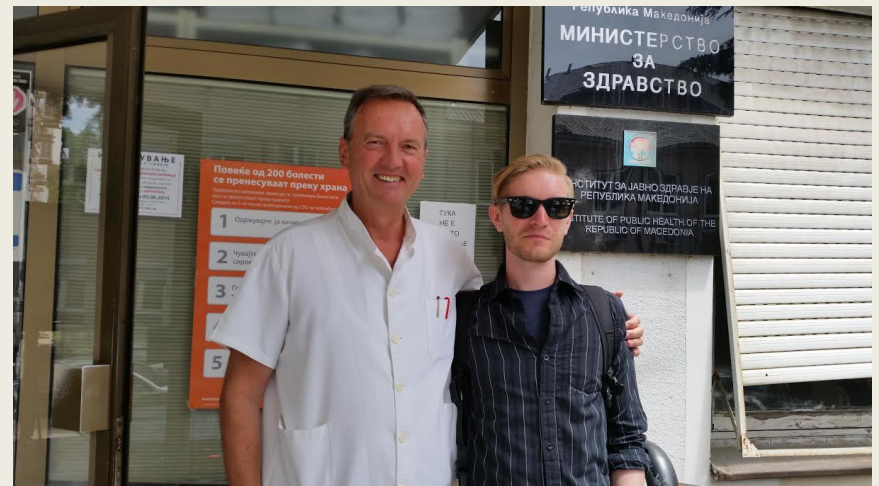
Evaluating WASH policy impacts in Macedonia