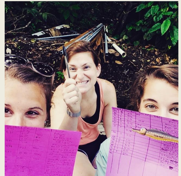
Ecotourism SWOT analysis in Costa Rica