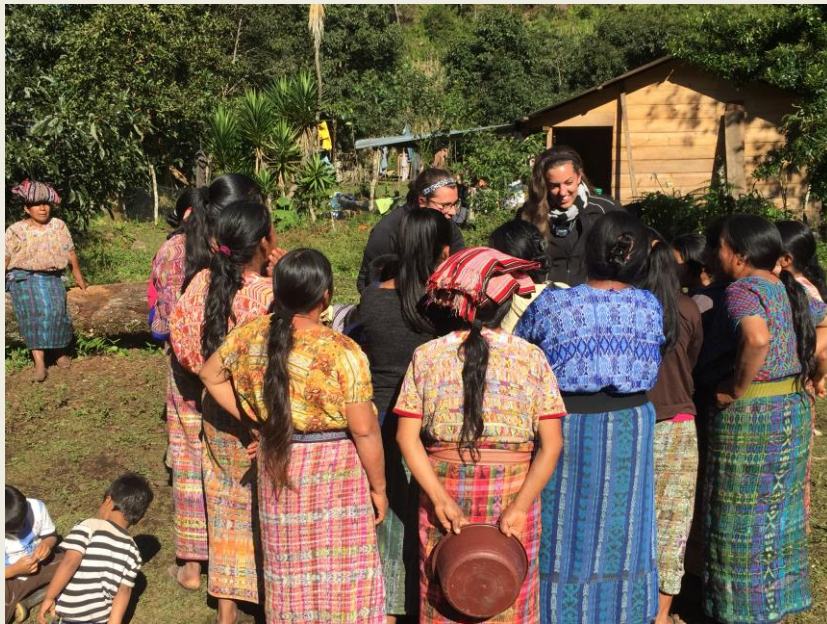
Assessing women's development needs in Guatemala