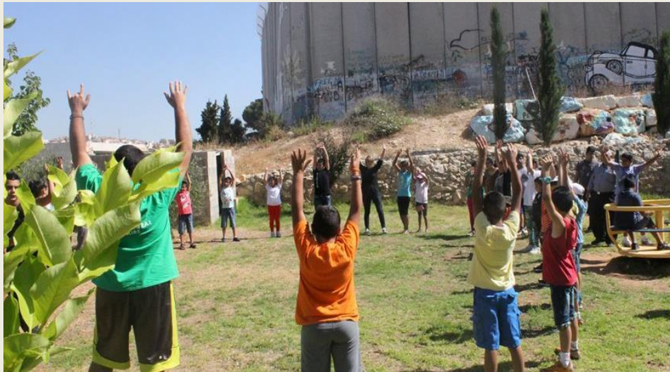
Leading a trauma-healing workshop in Palestine